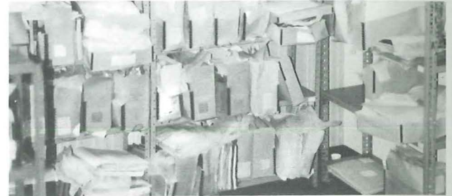
Water damaged documents, Our Lady of Mount Carmel Archives

In midsummer when our material was returned, fellow-archivists from the New Orleans area volunteered to help restore the damaged materials. They removed covers which fell apart when touched, cut and photocopied the contents for transfer to acid-free folders.